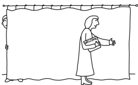
EVASD THE WELCOMERS

HOW TO GIVE CHURCH A TRY WITHOUT DETECTION