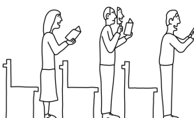
TRY TO BLEND IN